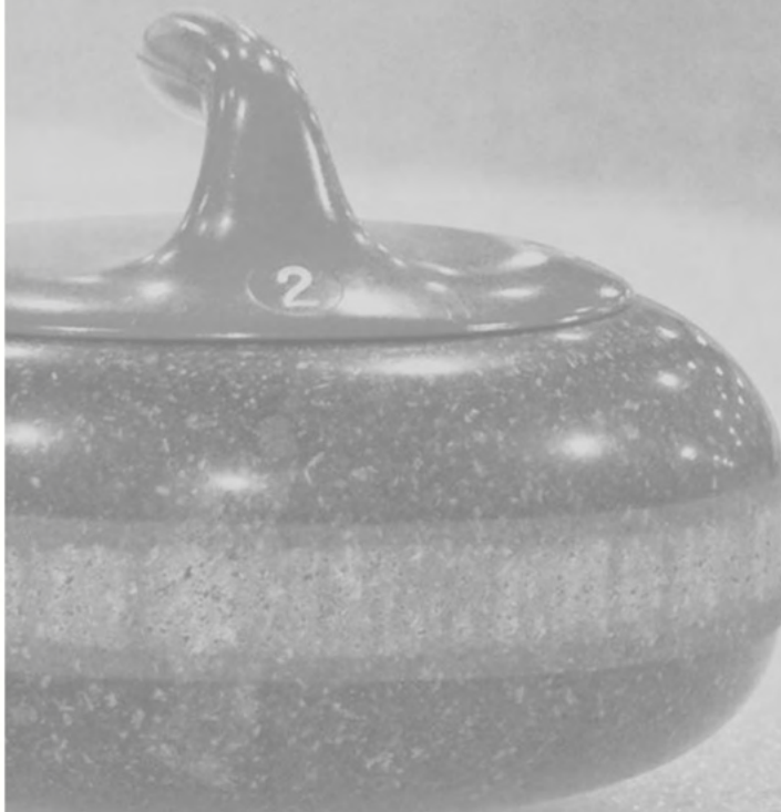
Cover Photo: 150th Logo Gold | Adobe Stock End Photo: Red and White 150th Birthday Cupcake Design | Adobe Stock