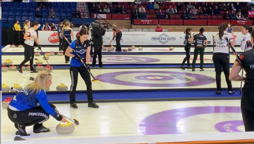
Photo Captions (above clockwise): 1 - The event grounds at North Bay Memorial Gardens, 2 - Emma Miskew (left) and Rachael Homan (right), 3 - Jennifer Jones (bottom left) and Team