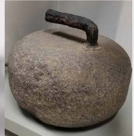
Curling Rock | circa 1885, possibly made with granite, with a curved metal handle.

It is said that irons for Curling originated in Quebec by General Wolfe's Highlanders, about 1761. Having no stones but plenty of scrap iron in the form of old French cannon, they melted some down in a shape halfway between a granite stone and a tea kettle.